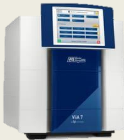
Real-Time PCR ViiA 7 -Applied Biosystems