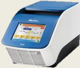
Thermal Cycler-Veriti 96-well Applied Biosystems