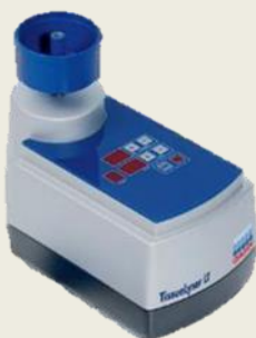
Tissue lysator By Qiagen