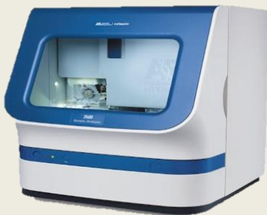
3500 Genetic Analyzer 3500 Genetic Analyzer by Applied Biosystems