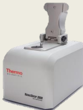
Nanodrop2000 Thermo Scientific