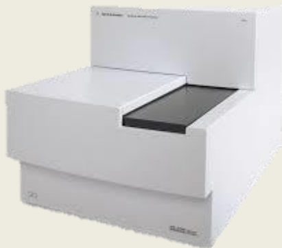
Microarray By Agilent technology